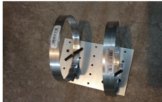
View of clamps connected to the zip ties with the plate installed behind the carpet inside the trunk

Create a brace in the recess of the driver's side of the trunk to secure the hydro pump unit to the vehicle. Use a 5 inch x 3 inch metal nail plate from the lumber section of a hardware store to fit behind the carpet in the recess. Drill a pair of holes about 4 inches apart toward each end of the plate. Secure nylon zip ties through each pair of holes. The zip ties serve as mounts (see Figure 4 ) for two 4 inch worm-gear clamps that will wrap around the plastic housing and hold it in the recessed area of the trunk.