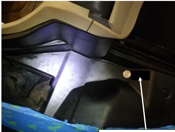
25mm x 75mm hole in the funnel above the recess of the driver's side of the trunk.

Re-locating the hydro pump unit to the trunk requires cutting of an oblong hole toward rear of the plastic funnel so the Bowden cable end, along with the 4 hydraulic hoses and the electrical wires can pass through the funnel to the trunk. See Figure 5 for the location to cut the hole above the trunk recessed area.