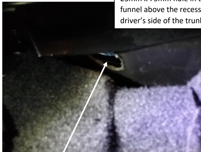
View of hole from inside the trunk

Use [redacted] [redacted], be careful, and wear protective gear! Top Hydraulics, Inc. is not responsible or liable for personal injury or material damage.