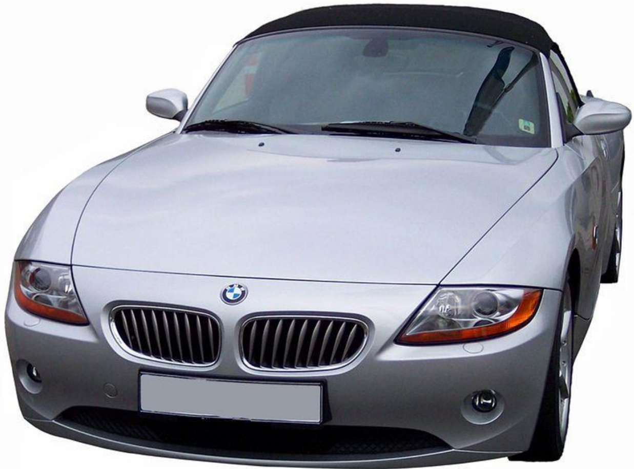
BMW Z4 - By: Eigenes Bild (CC-BY-SA)

Graciously provided by Chuck B in Illinois.